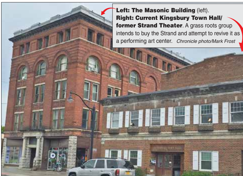
Left: The Masonic Building (left). Right: Current Kingsbury Town Hall/former Strand Theater. A grass roots group intends to buy the Strand and attempt to revive it as a performing art center.