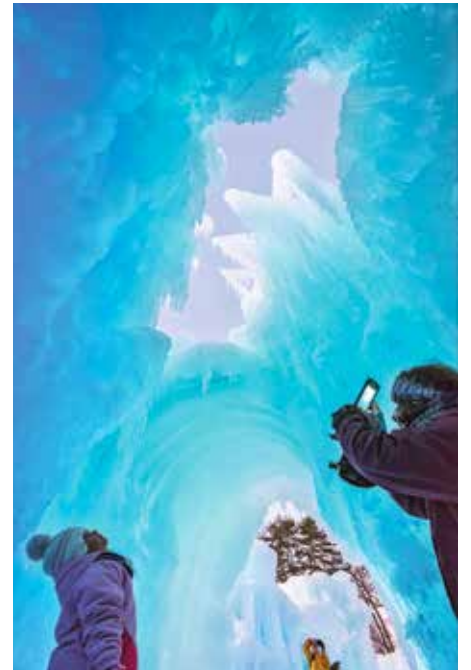
Inside LG's Ice Castle