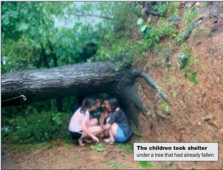
The children took shelter under a tree that had already fallen.