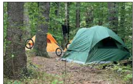
Tents in Cole's Woods, photo taken Saturday, Aug. 17.