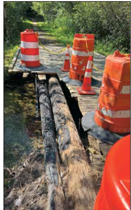
Fire — not of a ‘natural cause’ — damaged the bridge over Halfway Brook.