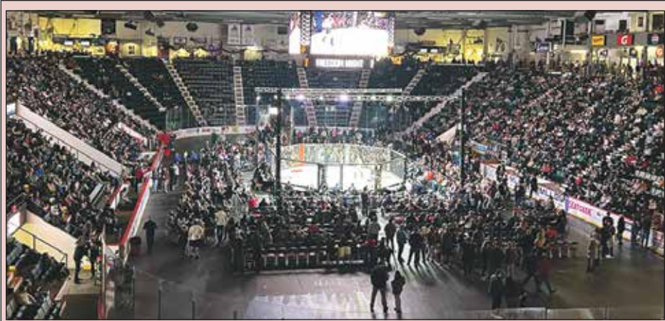
Cage Wars arena